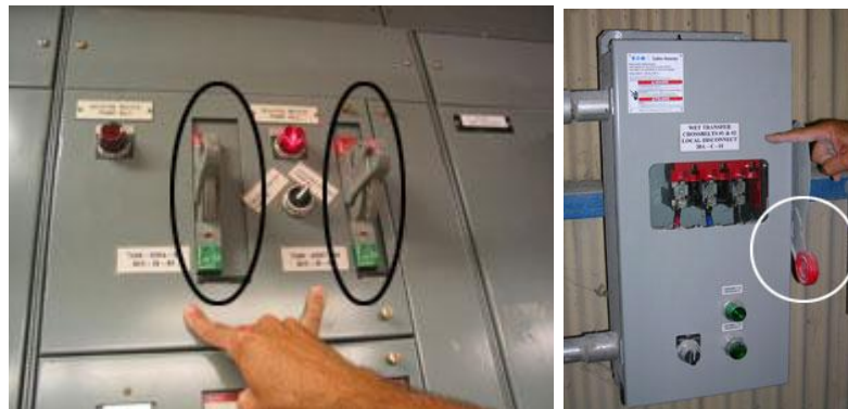
Disconnect panels with "lockout here" labels and energy isolation information