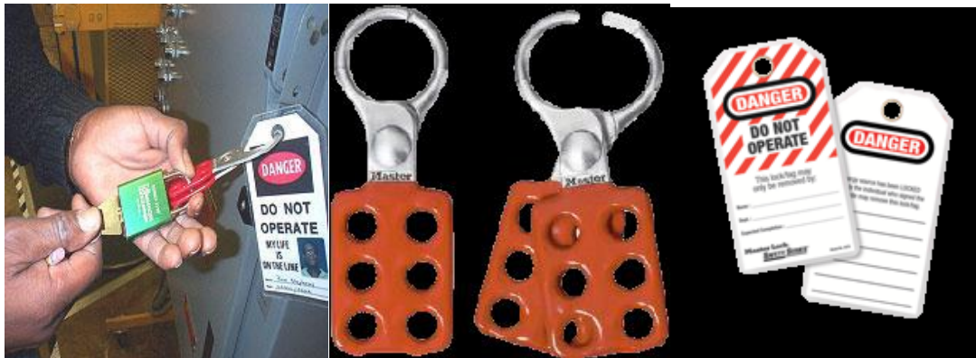
Typical locks and hasps for use in locking out equipment.