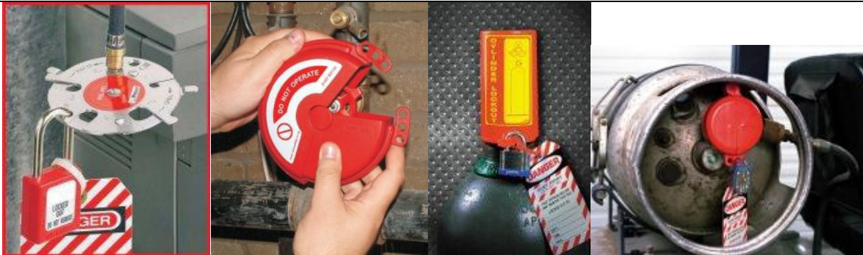
Locked com. Airline