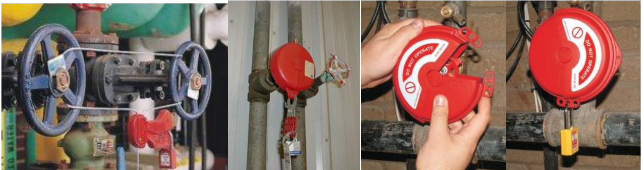
Piping shown "locked out"