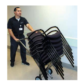
Use rolling carts to move stacks of chairs & tables

Moving and arranging heavy pieces of furniture involves forceful exertions. It is always better to use a mechanical aid.