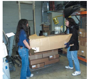
When lifting heavy awkward items ask for help.