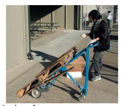
Large wheels roll easily and require less force over door thresholds, elevator gaps, etc.